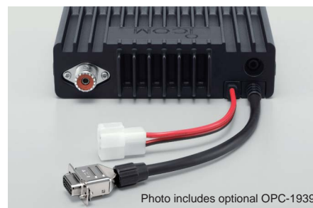
Photo includes optional OPC-1939

With the optional OPC-1939 D-SUB 15-pin ACC cable, the IC-F5022 series can be programmed to control an operating channel from an external device (up to 16 preprogrammed channels). The ACC connector also provides an ignition sensing function, external PTT, PC command, horn honk, audio output and modulated signal input depending on programming.